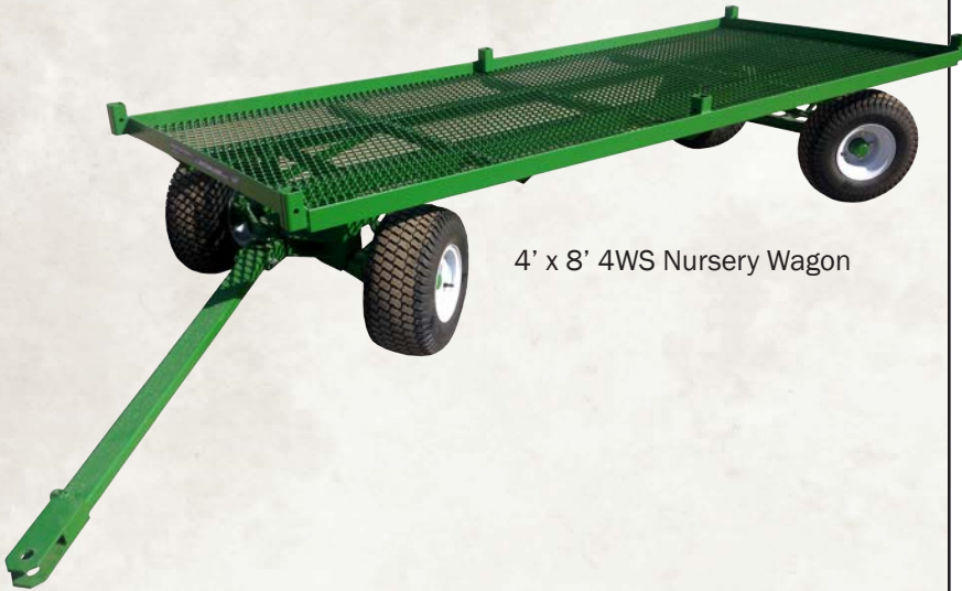
4' x 8' 4WS Nursery Wagon