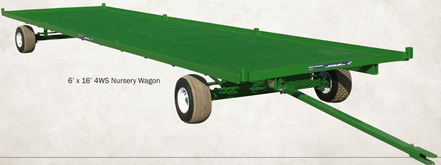
6' x 16' 4WS Nursery Wagon