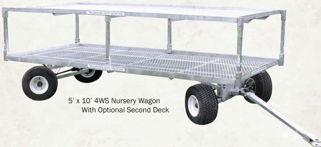
5' x 10' 4WS Nursery Wagon With Optional Second Deck